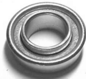
Regular Flanged Bearing (not sealed or machined steel)

The ergonomics of precision bearings also help in reducing injury or fatigue by improving rollability.