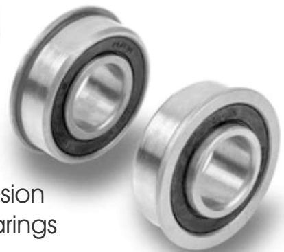
Sealed Precision Flanged Bearings (sealed)

Visit our website or give any of our locations a call for more information about any of our products or hints and application tips.